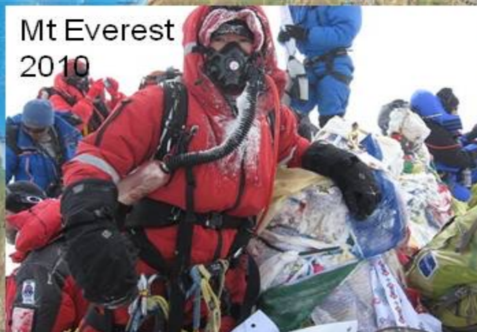
Mt Everest 2010