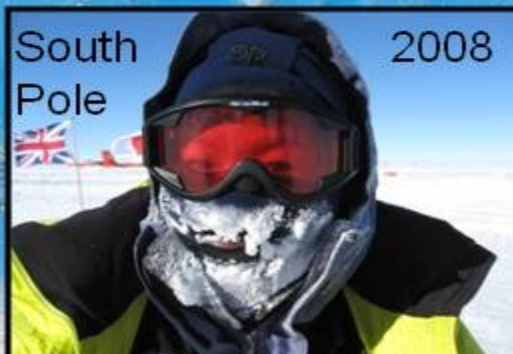
South Pole 2008