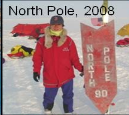
North Pole, 2008