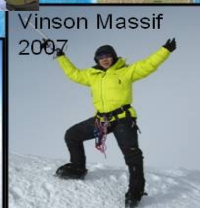
Vinson Massif 2007