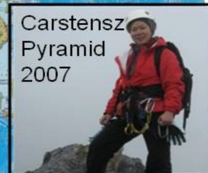
Carstensz Pyramid 2007