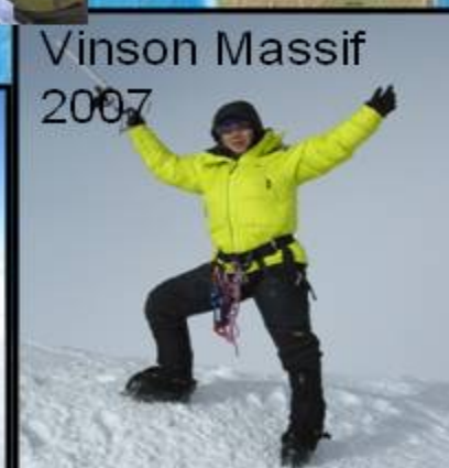
Vinson Massif 2007